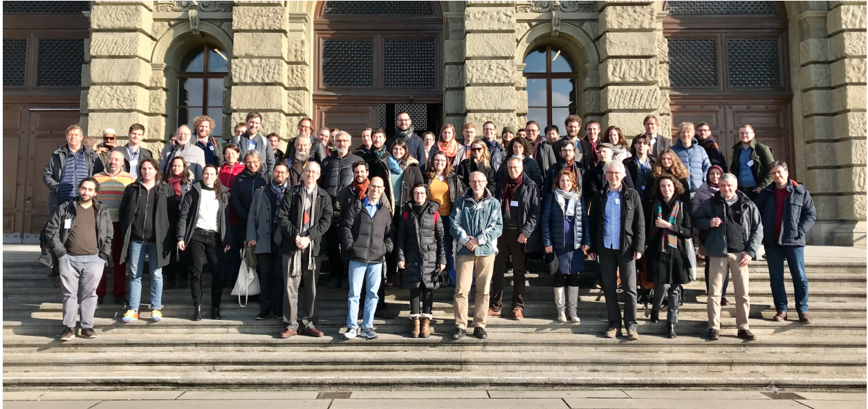
Participants at the 5th International Meeting of the APMP, January 18–22, 2020, Zurich, Switzerland.

large diversity of topics presented in the sections and by the invited speakers. This underscores our aim of being open to the philosophy of mathematics broadly conceived.