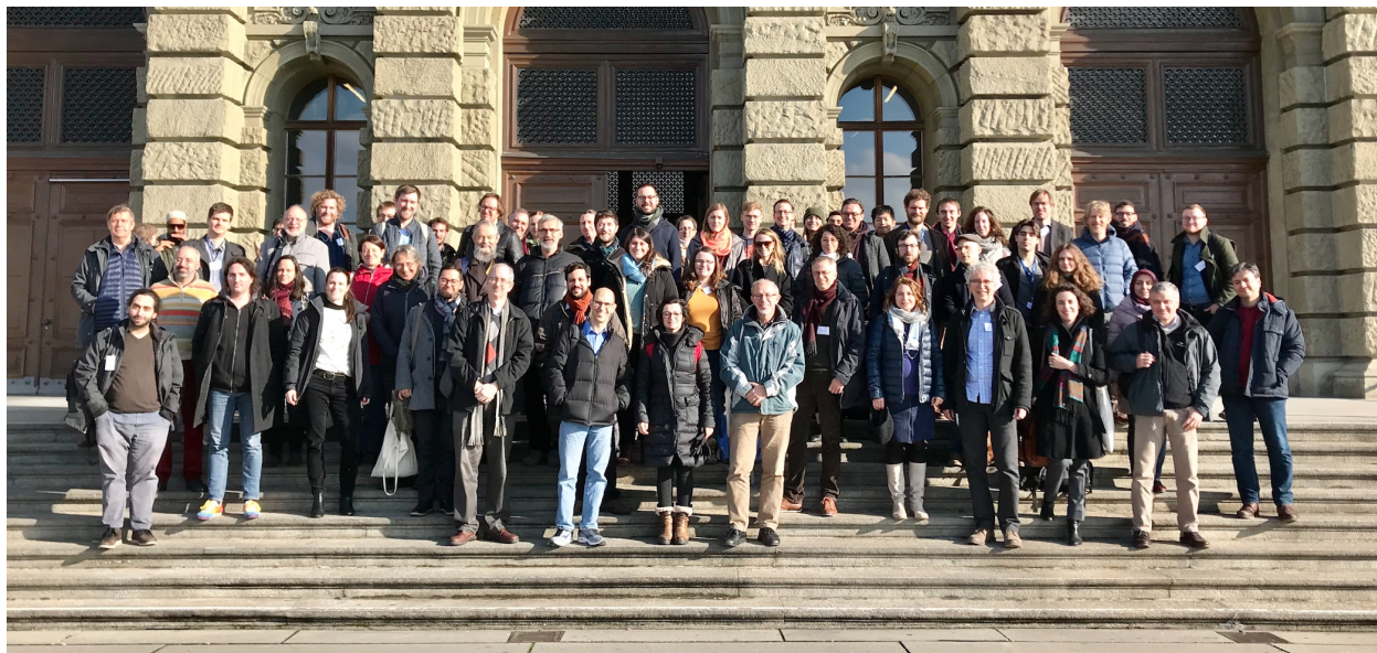
Participants at the 5th International Meeting of the APMP, January 18–22, 2020, Zurich, Switzerland.