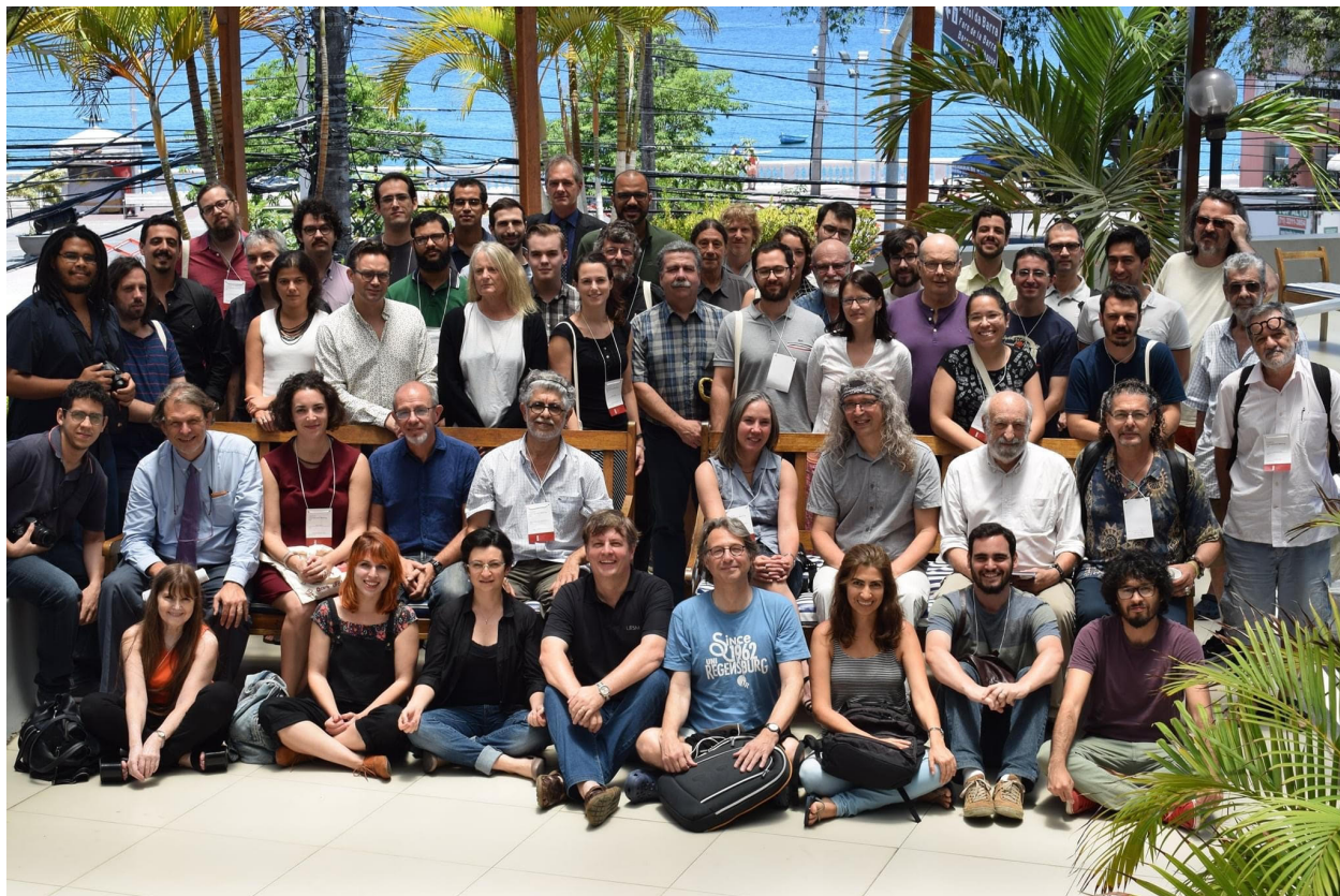
From the 5th International Meeting of the APMP held in Salvador, Brasil.

with an additional (maximum of) 45 minutes for discussion with students of the course and other participants.