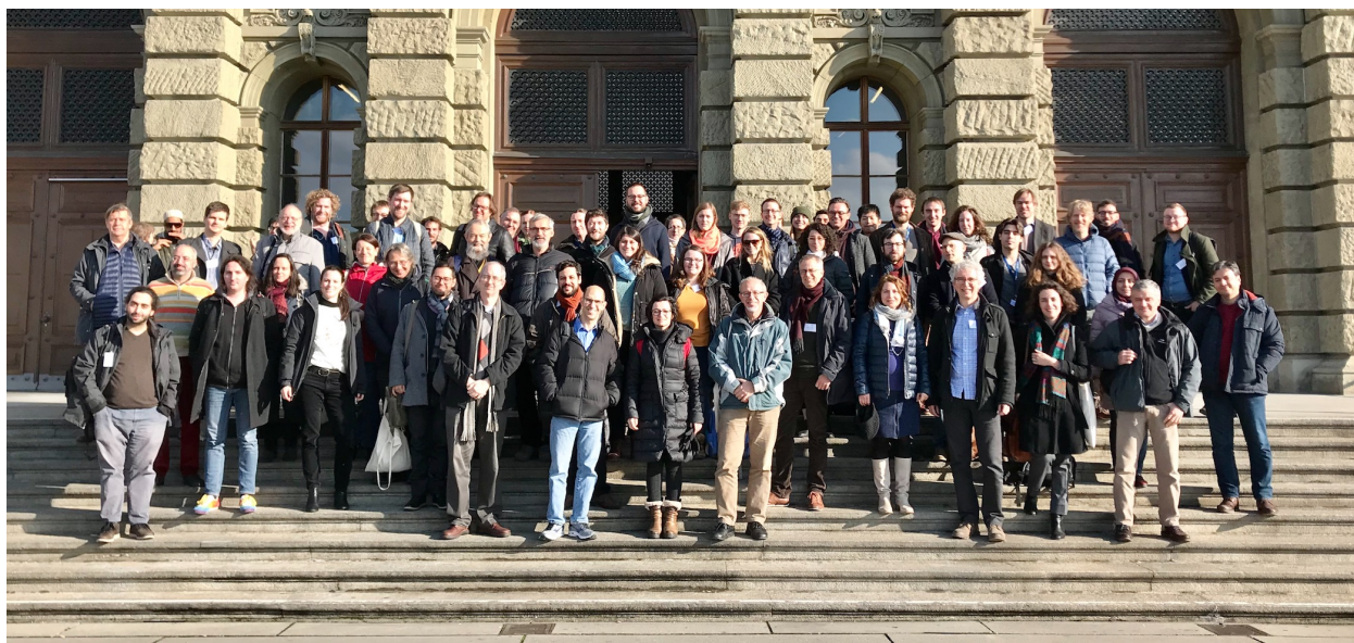
From the 5th International Meeting of the APMP held in Zurich, January 2020.