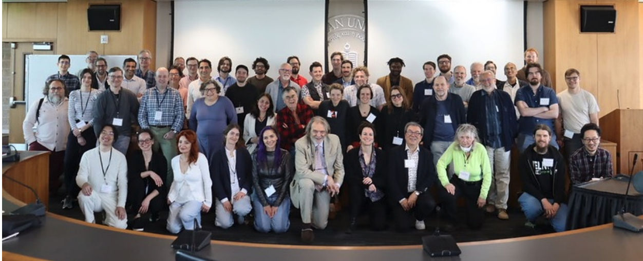
8th conference of the APMP held at Chapman University.